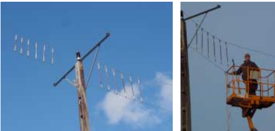
Fig. 3. Insulators mounted in Kołobrzeg-Karsibórz (upper side powered) and connecting measuring equipment.