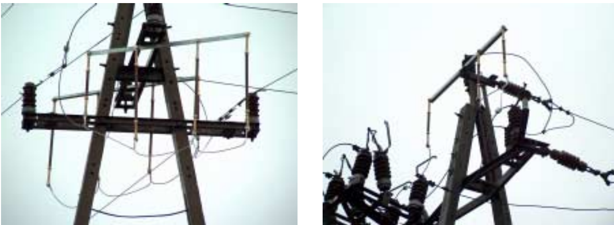
Fig. 2. Insulators mounted in Dźwirzyno at two sites (lower side powered).

Pictures below present ageing stations and insulators mounted to lines.